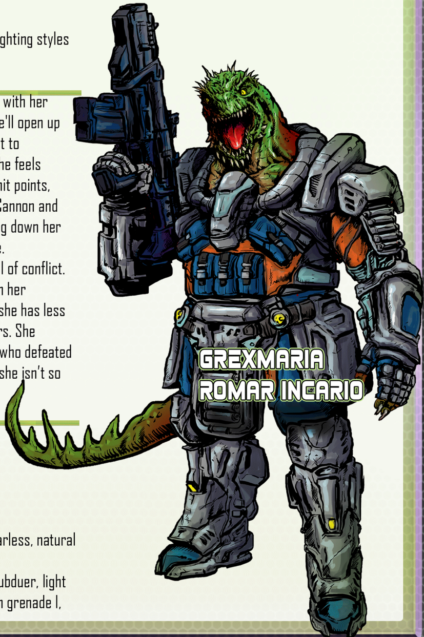
GREXMARIA ROMAR INCARIO

charge cloak, beacon, radiation sweeper, enhanced camera scanner, jump jets, mk I mobility enhancer, prison badge ID card.