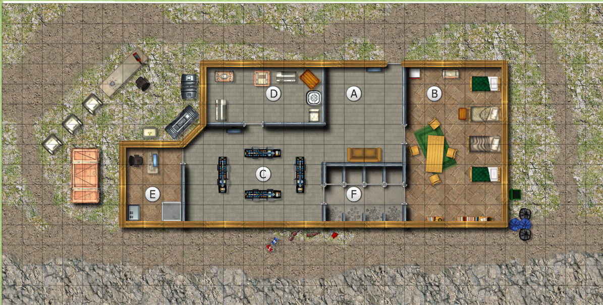
table stands to one side. The table is paired with a broken chair. A well trodden path surrounds the building.

There are two Prison Guards standing by the cliff side facing the camp of Early Retirement. The prison guards outside all have a copy of the key for the lock. The guards will halt anyone who approaches and question them as to why they approach. It's a Bluff check DC 15 to get past them with a lie to see Grexmaria. Fighting outside will alert those inside to the hostile intent of the PCs.